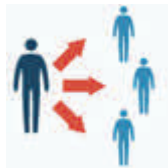
Close Contact with People